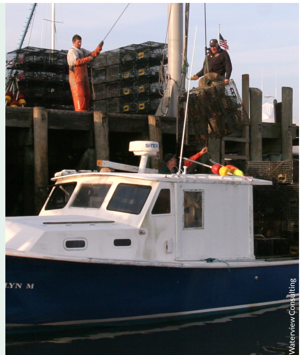
A working waterfront along the coast of the Gulf of Maine.

Goal 3 activities address the region's need for data, information, and partnerships to adapt to the changing environment.