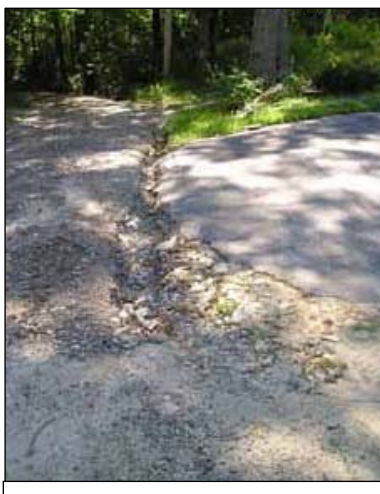
Overlook Drive - before