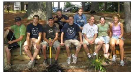
The Acton Shapleigh YCC fixed 27 sites on Square Pond, exceeding their project goal of 20 sites.

The project purpose was to fix 21 priority NPS sites from the watershed survey, including three roads, a parking lot, a town beach and 16 residential properties. The project also aimed to provide technical assistance to 20 landowners and partner with the Acton Shapleigh YCC to install conservation practices at another 16 residential sites. Community outreach included four newsletters to the 500 watershed residences, press releases to local newspapers and six neighborhood ‘septic socials’ to teach residents about septic system maintenance.