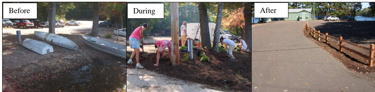
The Treasure Island ferry parking lot was re-graded and resurfaced with recycled asphalt, and a central rain garden was installed to capture and treat runoff. Volunteers installed ECM and 84 plants to create a shoreline buffer.