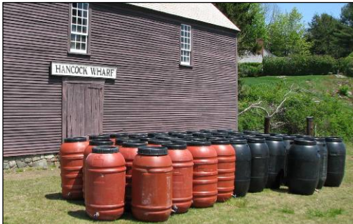
100 local residents purchased rain barrels