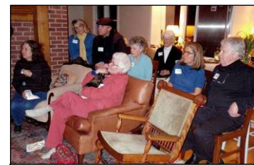
110 people attended six 'residential socials'

Local residents hosted three septic socials (45 participants) and six residential socials (110 participants). The project also launched a website, established a discount rain barrel program, and conducted an intercept survey at the beginning and end of the project. 34 residents pledged to complete 444 watershed-friendly practices and received a yard sign to show their participation. Local newspapers covered several events during the project.