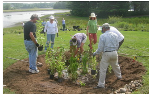
Volunteers help install a rain garden