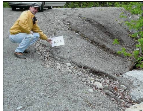
A volunteer helps document an erosion site on a private road.