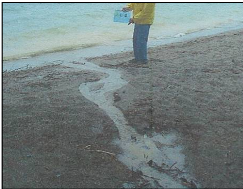
An eroded channel carries sediment directly into Beech Hill Pond.