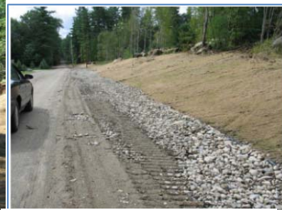
After – bank removed, slope stabilized, ditch installed