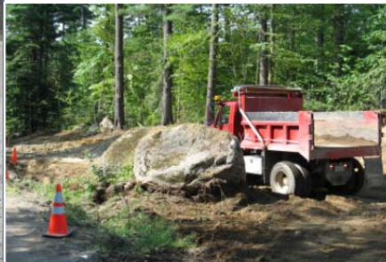
During – removing bank, including large boulders