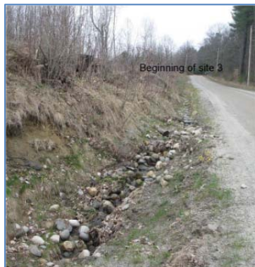
Before – eroding bank and ditch

Significant reconstruction of eroding sections of the town-owned Packard Road was completed. The Packard Road project won a 1st Place State of Maine Excellence Award at the 2012 Highway Congress sponsored by the American Public Works Association