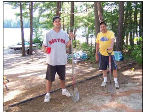
Landowners install a rubber razor to divert driveway runoff into a buffer.

The project goal was to address priority NPS sites from the watershed survey and continue to strengthen relationships with landowners and project partners. Cost-sharing assistance to address 22 large-scale NPS sites was provided to towns, road associations, and private landowners. The ASYCC also provided labor to install conservation practices at 34 residential sites. Technical assistance was provided to 32 landowners, and five septic socials were conducted. Project outreach included four project newsletters that were mailed to 500 landowners, installation of signs at six road projects, and presentations at SPIA meetings. Refrigerator magnets listing lake protection tips were also created and provided to rental units on the lake.