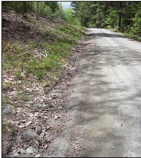
Scouring of ditch. Long run with no cross culverts or turnouts.