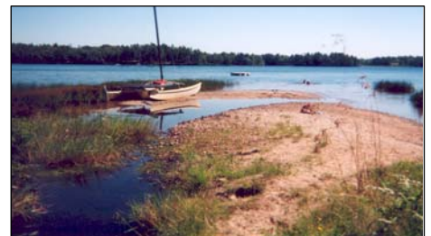
Sediment delta from erosion on roads and residential properties.

The collected information was then shared with the community and used to develop a watershed management plan. In April 2003, about 50 residents and town officials participated in a daylong community forum where they identified issues and developed strategies to protect Forest Lake. Participants then formed four workgroups and met throughout the summer to further flesh out these strategies. Staff created the draft plan, obtained public input and distributed copies of the final plan to the public.