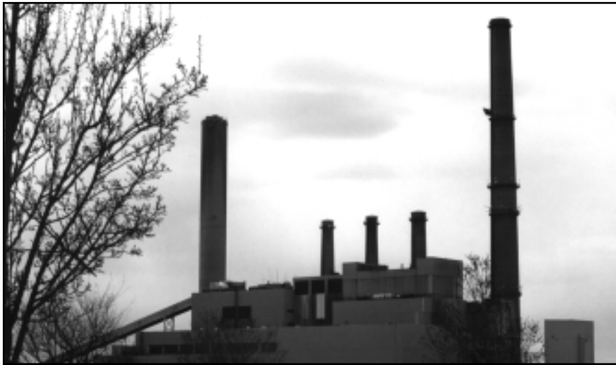
Mercury enters the atmosphere during combustion and incineration processes that take place at power plants and other industrial facilities. Once in the atmosphere, it can travel across international borders.

At its June 1998 conference in New Brunswick, the Conference of New England Governors and Eastern Canadian Premiers (NEG/ECP) adopted two action plans to reduce mercury and acid rain emissions. A workshop on the plans' progress was scheduled for June 4 in Portland, Maine.