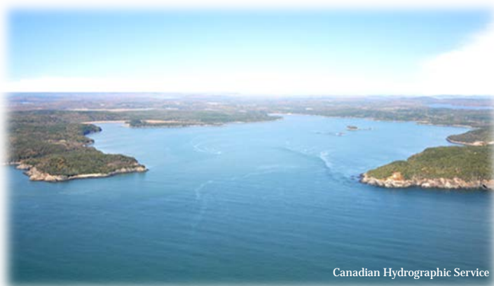
Canadian Hydrographic Service

In 1998 the Conservation Council of New Brunswick (CCNB), with support from the Fundy North Fishermen's Association and the local community, proposed the Musquash Estuary and surrounding intertidal area as a candidate Marine Protected Area (MPA) under the Oceans Act. In December 2006 the Musquash Estuary, including the waters, marshes, and intertidal zone, received formal designation as a protected area. The Musquash MPA and administered intertidal area are managed by Fisheries and Oceans Canada in collaboration with an advisory committee composed of representatives from government, non-government organizations, First Nations, industry, and local community groups. In recognition of the importance of the area, complimentary conservation efforts by the Nature Conservancy of Canada, Ducks Unlimited, and the Province of New Brunswick have led to the protection of the majority of the lands surrounding the Estuary, as well as the watershed that feeds the Estuary.