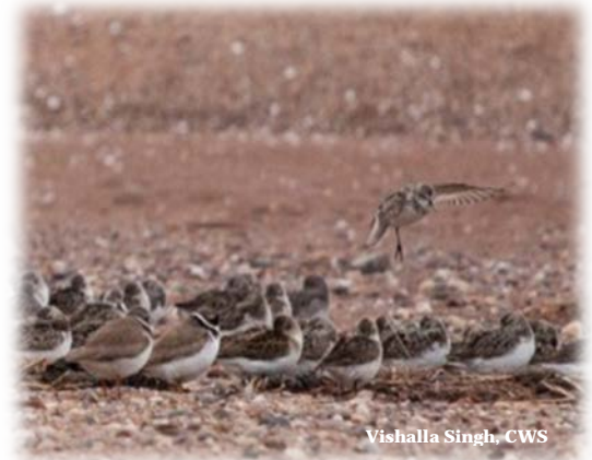
Vishalla Singh, CWS

*Please note: To log this Earthcache, please visit Geocaching.com for additional tasks or questions to be completed.